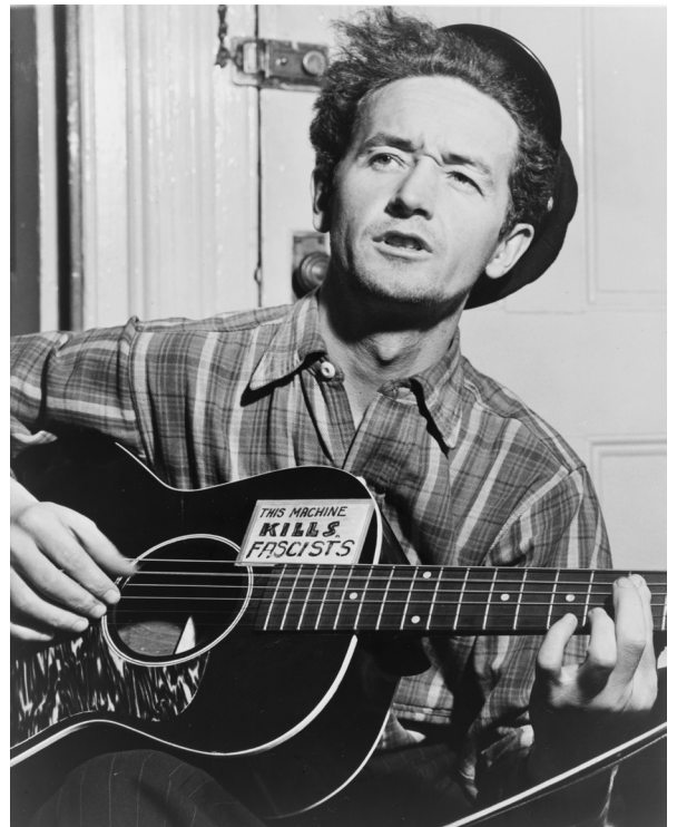
Mr. Woody Guthrie playing his emblematic guitar.

Mr. Woody Guthrie was born in 1912 in a small town in Oklahoma called Okemah. He is a singer-songwriter and musician whose musical legacy includes hundreds of political, traditional, and children's songs. Many of his songs are about his experiences during the Great Depression when he traveled with displaced farmers from Oklahoma to California and learned their traditional folk and blues songs, earning him the nickname the "Dust Bowl Troubadour".