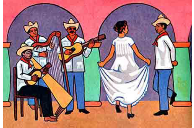
A typical “son jarocho” group with dancers.

Listen to the instruments played in “ La Golondrina ”. The first instrument you hear is a requinto from the same family as the jarana , and is the one in charge of introducing the melody of the song. Other than the jarana , the leona and the violin , can you guess which other instruments are being played? Who's playing the percussion in the ensemble? Which of these instruments are common in other music? What instruments are different?.