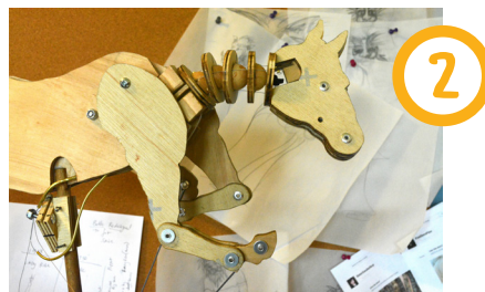
2 Constructing the movement mechanisms.