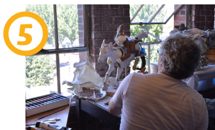
5 The figures are painted.