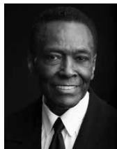
ARTHUR MITCHELL (Co-Founder)