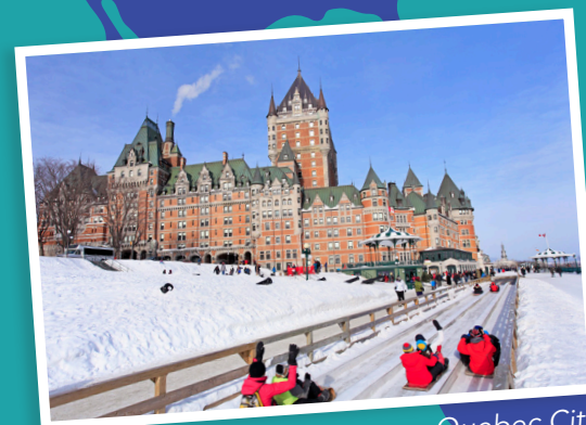
Chateau Frontenac, Quebec City