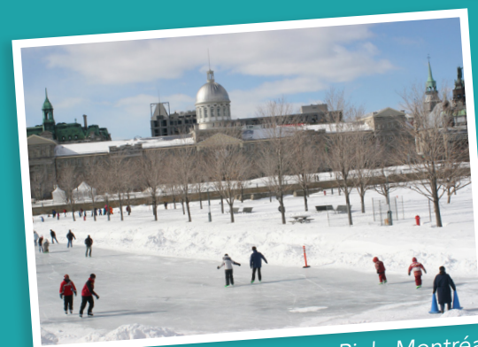
Old Port Ice Skating Rink, Montréal