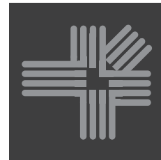
ANONYMOUS One Hundred and Five Previous Sponsorships Ten Current Sponsorships