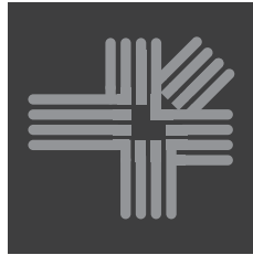
ANONYMOUS Eighty-Five Previous Sponsorships Ten Current Sponsorships

JOIN THESE INSPIRING DONORS BY CONTACTING OUR DEVELOPMENT TEAM TODAY: KrannertCenter.com/Give • development@krannertcenter.illinois.edu • 217.333.1629